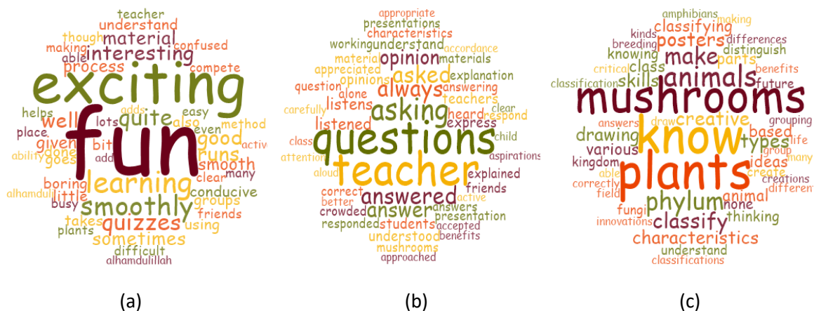
Figure 2. (a) Student’s learning process, (b) Student’s learning value, (c) Student’s skills

Table 2. equation can explain that a constant of 110.525 means that the consistent value of the entrepreneurial skills variable is 110.525. The X regression coefficient of 0.577 explains that every 1% increase in the value of creative thinking infusion, then the value of entrepreneurial skills increases by 0.577. The regression coefficient is positive (positive number), it can be concluded that the direction of the influence of the creative thinking infusion variable on entrepreneurial skills is positive. Decision making simple regression test based on the significance value of the coefficient table obtained a significance value of 0.557 > 0.05 so it can be concluded that the creative thinking infusion learning framework variable has no effect on student’s entrepreneurial skills. Based on the t value, it is known that the t_{count} value is 0.594 < t_{table} 2.040 so it can be concluded that the creative thinking infusion learning framework variable has no effect on the entrepreneurial skills variable. So that the hypothesis which says there is an effect of creative thinking infusion learning framework on student’s entrepreneurial skills is rejected.